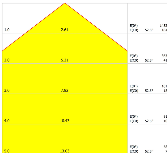
Distance [m] Cone Diameter [m] Illuminance [lx] — C0 - C180 (Half-value Angle: 105.0°)