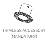
TRIMLESS ACCESSORY (MANDATORY)